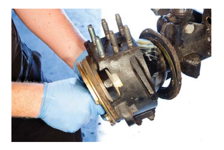
STEP 9 - CHECK STEERING PRELOAD

Install knuckle on vehicle with shims and steering arm.